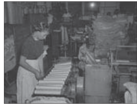
The U.S. Government Printing Office and the Office of the Federal Register are partners in publishing the daily Federal Register . Here a GPO employee operates one of the bindery machines, ca. 1960.

Although the Office of the Federal Register is not often directly involved in litigation, in 1995 and 1996 the Office became entangled in a lawsuit