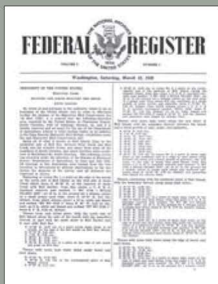
First cover of the Federal Register , March 14, 1936.